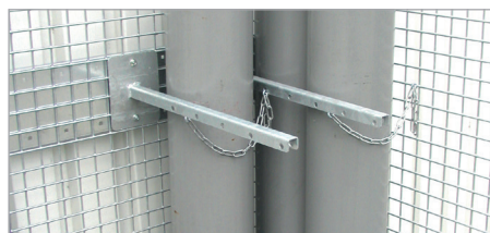
Fixture with safety chain